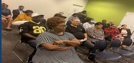
Community Information Session with Stakeholders