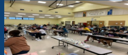
Data-Driven Family Night, Fifth Ward Elementary