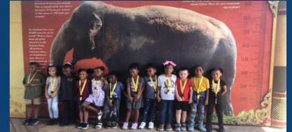
Fifth Ward Elementary Field Trip to Audubon Zoo