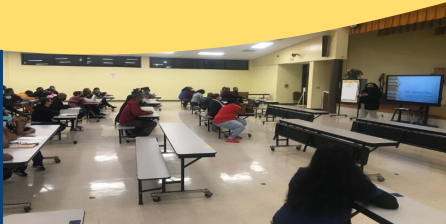
Parental Involvement Meeting, Fifth Ward Elementary