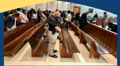
Public Meeting; Program Launch, 40th Judicial District Court