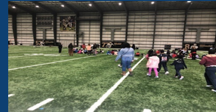
Saints Camp Literacy Night